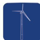
Industrial Oil & Gas